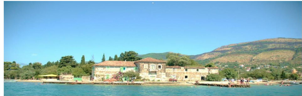
View of Verona beach from the sea